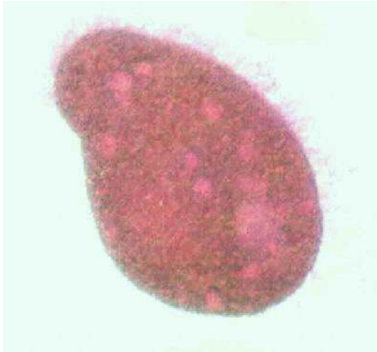
Photo of Brooklynella parasite. Note cilia all along the outer surface. X 400.

It like so many others is a ciliated protozoan which in many respects resembles its counterpart in fresh water Chilodonella ( see my previous article ). When conditions become favourable to its reproduction, very rapid multiplication takes place , reproduction occurs by simple binary fission, and such massive reproduction can and does cause fatalities , which is brought about by severe weakening of the host fishes.