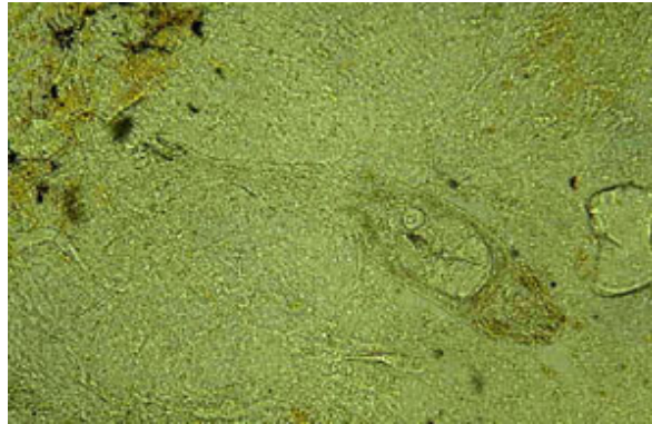
Gyrodactylus elegans. Photo shows embryo developing inside the parasite.

In this article I propose to deal with a very common fresh water parasite viz. Gyrodactylus & a Marine parasite called Brookynella.