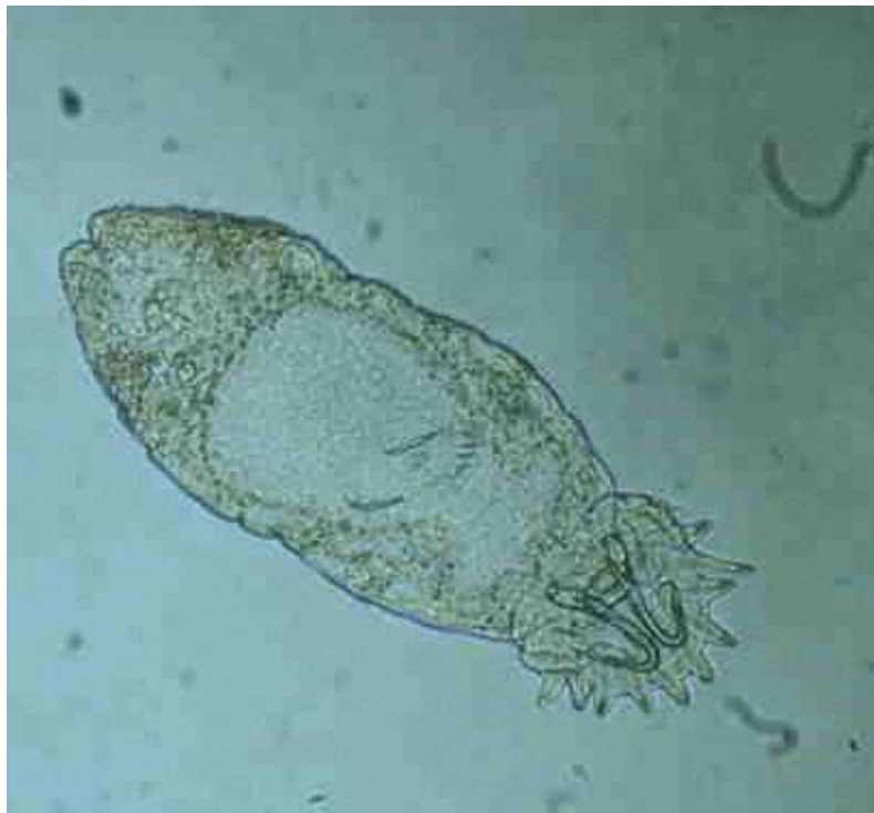
Saltwater form of the parasite showing typical hooks which are common to all forms of this species.

This very broad group of parasites is widely distributed, & attacks many species of tropical fish kept in Aquaria